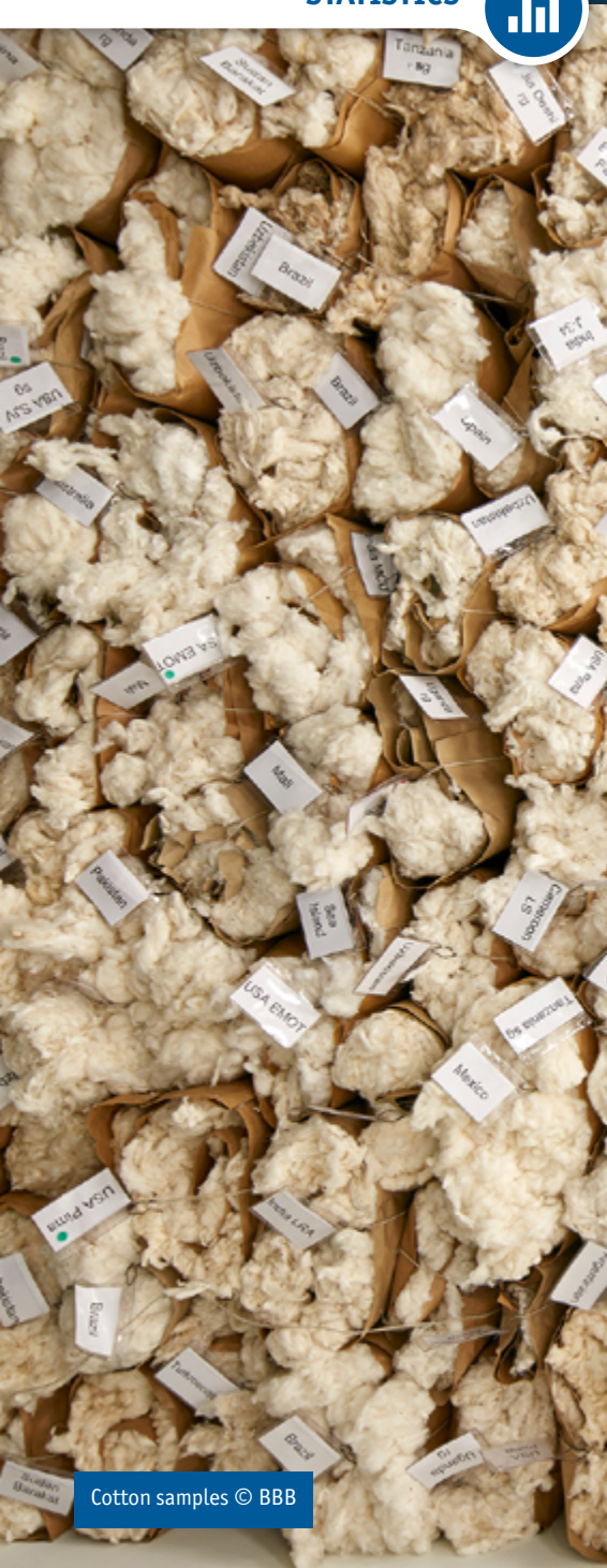
Cotton samples